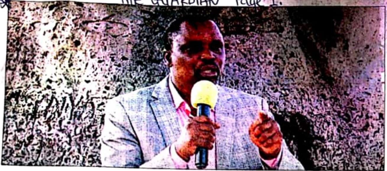
Livestock and Fisheries minister Mashimba Ndaki