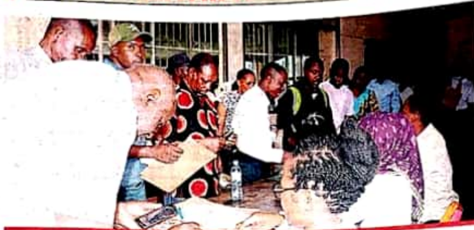
Baadhi ya wananchi wa Mkoa wa Mwanza wakikamilisha taratibu za kupatiwa hati za ardhi kabla ya kukabidhiwa na Naibu Waziri wa Ardhi, Nyumba na Maendeleo ya Makazi, Dk. Angeline Mabula, katika ukumbi wa Ofisi ya Mkuu wa Mkoa wa Mwanza, akiwa katika ziara ya siku moja katika mkoa huo.